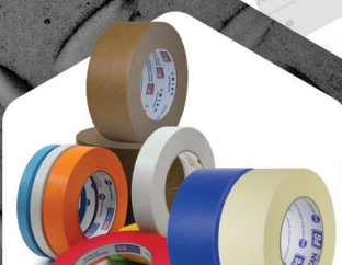
MASKING & FLATBACK TAPES