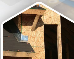
BUILDING & CONSTRUCTION