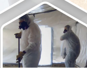
REMEDICATION & RESORATION