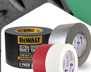
DUCT / FOIL / PE TAPES