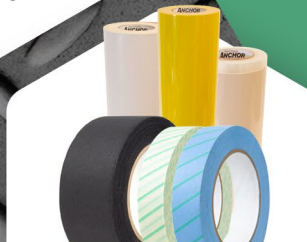
STENCIL & SPECIALTY TAPES