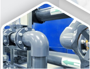
MANUFACTURING / MRO