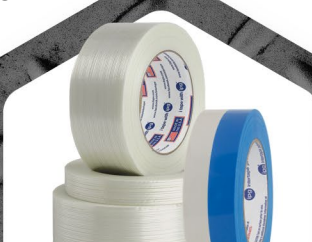
FILAMENT & MOPP TAPES