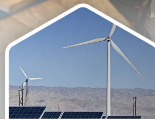
ELECTRICAL / ELECTRONIC